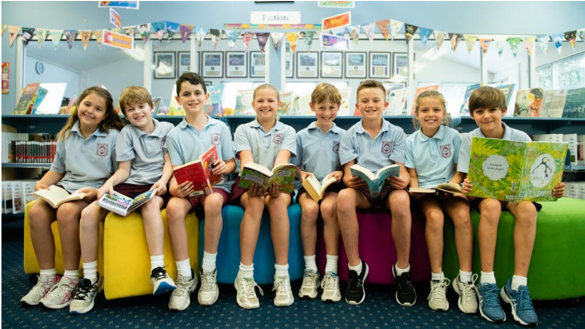
St Rose students enjoying books in the library.

The school's co-curricular meditation initiative has also provided students with the tools to increase focus and remain calm in stressful situations such as NAPLAN testing.