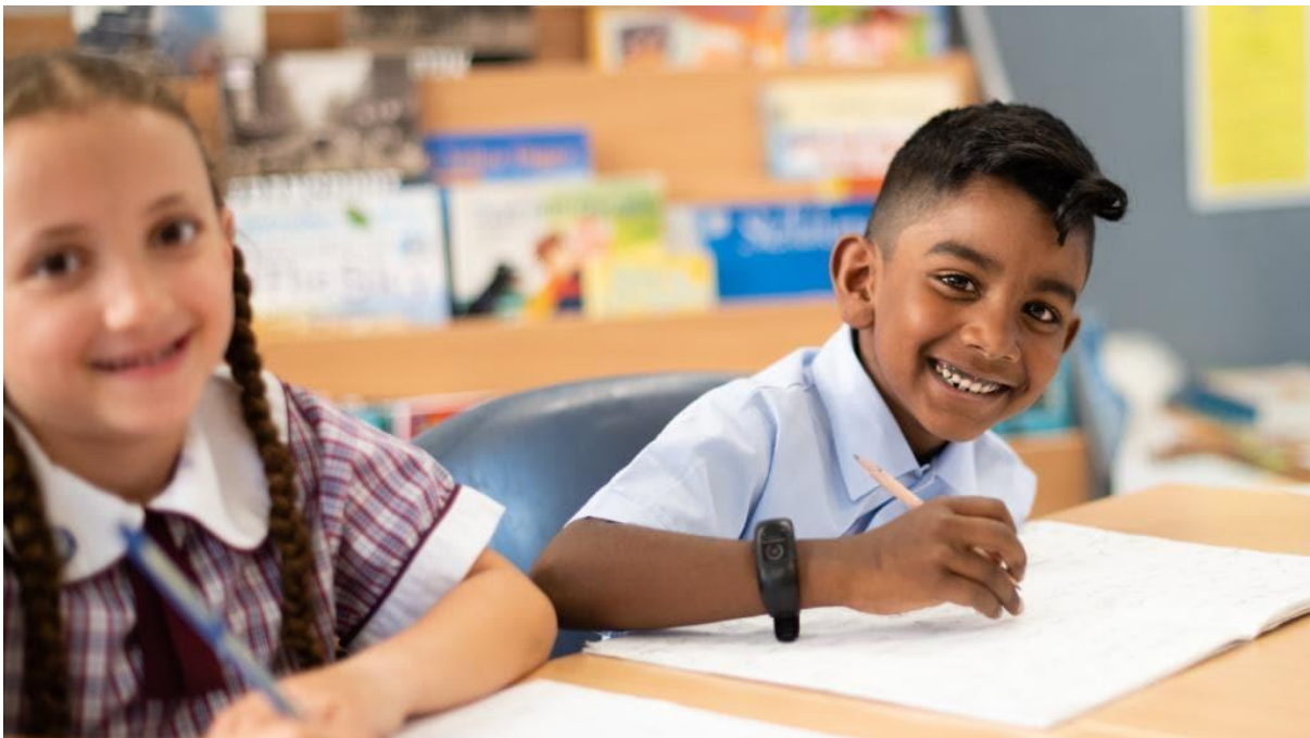
St Rose Catholic Primary School students.

“We have identified spelling and sentence structure, in writing, as areas of continued focus,” she said. “Through working mathematically we aim to improve students’ problem solving, reasoning and creative thinking skills.”